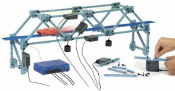
Fig. 1. A typical truss, with instrumented members.

We propose to purchase several Pasco Structures Systems consisting of modular plastic components and PC-readable load cells (Fig. 1). A major benefit of the Pasco Structures Systems is the ease in which structures can be assembled and real-time measurements taken (Fig. 2). The ease of assembly makes these packages convenient for classroom use. We would like to invest in two bridge truss systems, each complete with six load cells and one amplifier/USB link. These systems will allow students to work in smaller groups within a classroom setting or to compare different truss designs within a single lecture or tutorial session. The sensors will be interfaced to laptops provided by the course instructor or TAs.